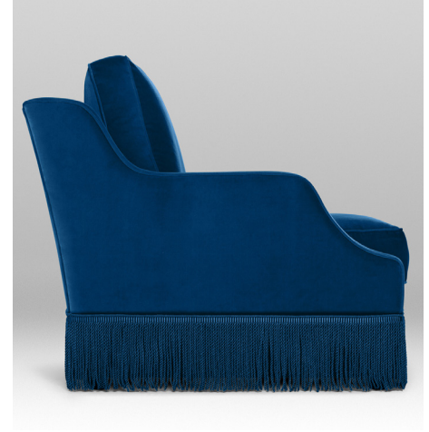
Shown in Orior Velvet / Acorn with Samuel & Sons Loire Bullion Fringe.